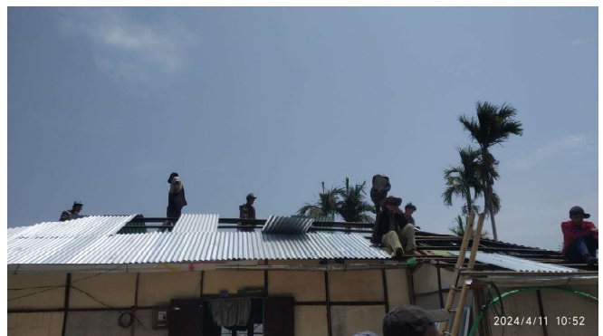
Hail struck houses at Zohmun village repaired by YMA members of T̄inghmun, Mauchar and Sakawrdai