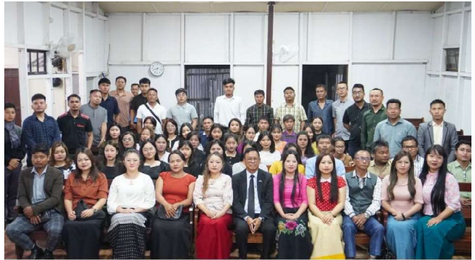
On April 22, 2024, Bawngkawn Brigade Baptist TKP Unit and Bawngkawn Branch YMA held a joint service based on the slogan of 'Working together for the betterment of the community'