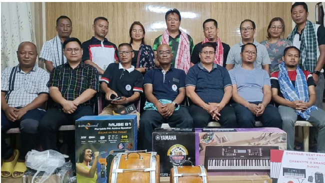
As per the request of the Central YMA, on April 16, 2024, Chanmari West Branch YMA showed fraternity to the less opportuned Chawngte 'C' Branch by donating their much needed musical instruments and other implements