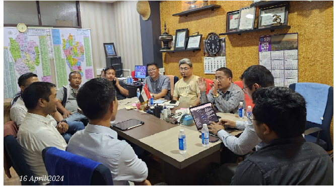
The CEC Meeting had resolved to use the services of Lailen Consultancy Pvt. Ltd. for the production of an accounting software for a better and neater account keeping by the Finance Sub-Committee. Lailen Consultancy is also entrusted with producing a better profile app of the Central YMA